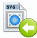
File SVG Back