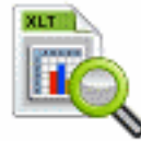
File XLT Zoom