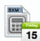
File SXM Calendar