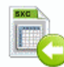
File SXC Back