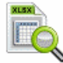
File XLSX Zoom