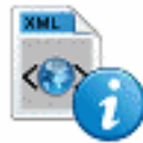
File XML Info