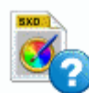
File SXD Question