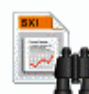
File SXI Search