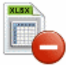
File XLSX Remove