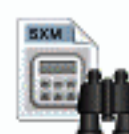
File SXM Search