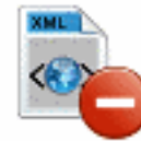
File XML Remove