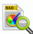
File SXD Zoom