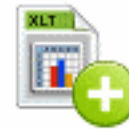
File XLT Add