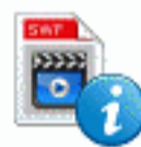
File SWF Info