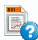
File SXI Question