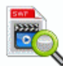
File SWF Zoom