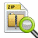
File ZIP Zoom