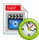
File SWF Clock