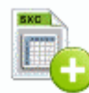
File SXC Add