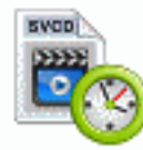
File SVCD Clock