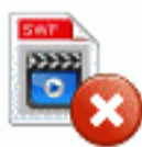
File SWF Cancel