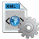
File XML Config