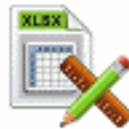
File XLSX Tools