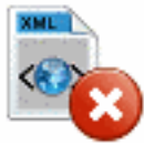
File XML Cancel