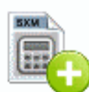
File SXM Add