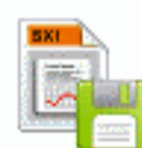
File SXI Save