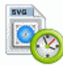
File SVG Clock