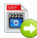
File SWF Next