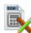
File SXM Tools