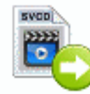
File SVCD Next