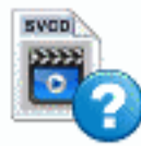
File SVCD Question