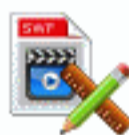
File SWF Tools