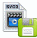
File SVCD Save