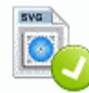
File SVG Ok