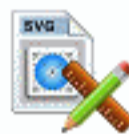
File SVG Tools