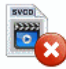
File SVCD Cancel