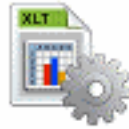
File XLT Config