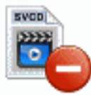
File SVCD Remove