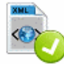
File XML Ok