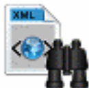
File XML Search