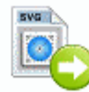
File SVG Next