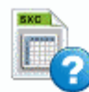
File SXC Question