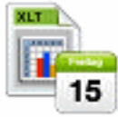
File XLT Calendar