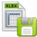
File XLSX Save