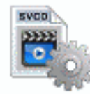
File SVCD Config