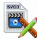
File SVCD Tools