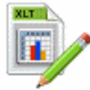
File XLT Write