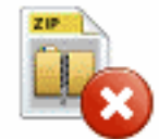
File ZIP Cancel