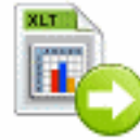
File XLT Next