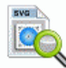
File SVG Zoom