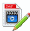
File SWF Write