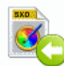
File SXD Back