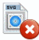
File SVG Cancel