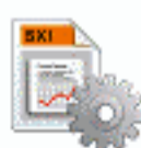
File SXI Config