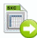
File SXC Next