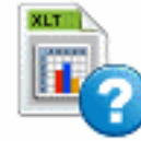
File XLT Question