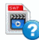
File SWF Question