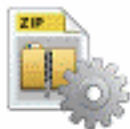
File ZIP Config