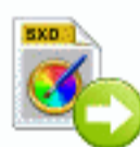
File SXD Next