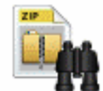
File ZIP Search