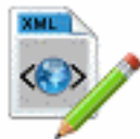
File XML Write