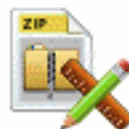
File ZIP Tools