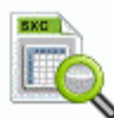
File SXC Zoom