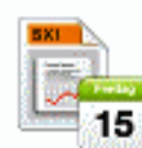
File SXI Calendar