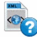
File XML Question