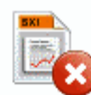
File SXI Cancel