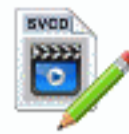
File SVCD Write