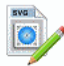
File SVG Write