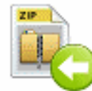
File ZIP Back