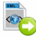
File XML Next