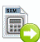
File SXM Next