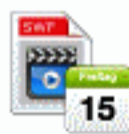
File SWF Calendar