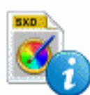
File SXD Info