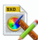
File SXD Tools