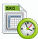
File SXC Clock