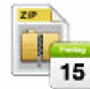
File ZIP Calendar