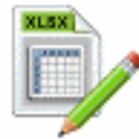
File XLSX Write