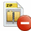
File ZIP Remove