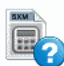
File SXM Question