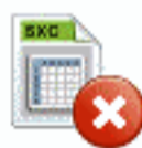
File SXC Cancel