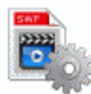
File SWF Config