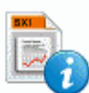
File SXI Info