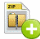
File ZIP Add