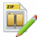
File ZIP Write