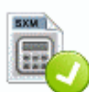
File SXM Ok