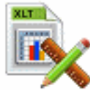
File XLT Tools