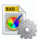
File SXD Config