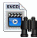
File SVCD Search