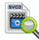
File SVCD Zoom