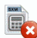
File SXM Cancel