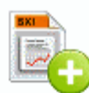
File SXI Add