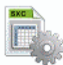
File SXC Config