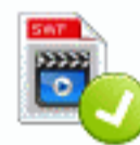
File SWF Ok