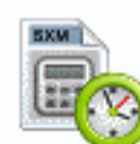
File SXM Clock