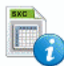
File SXC Info