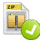
File ZIP Ok