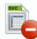
File SXC Remove