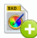
File SXD Add