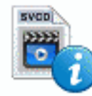
File SVCD Info