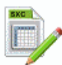
File SXC Write