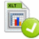
File XLT Ok