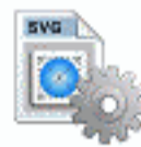
File SVG Config