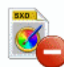
File SXD Remove