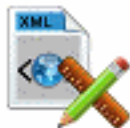
File XML Tools