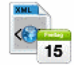
File XML Calendar