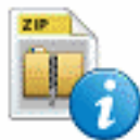
File ZIP Info