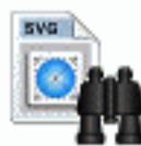
File SVG Search