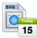
File SVG Calendar