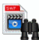
File SWF Search