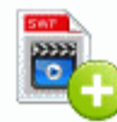
File SWF Add