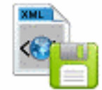
File XML Save