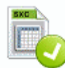
File SXC Ok