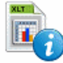
File XLT Info