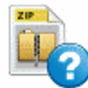
File ZIP Question