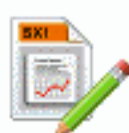
File SXI Write