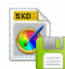
File SXD Save