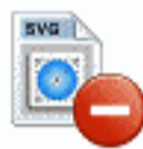
File SVG Remove