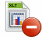
File XLT Remove