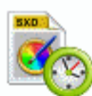
File SXD Clock