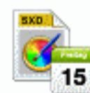
File SXD Calendar