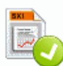
File SXI Ok