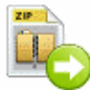
File ZIP Next