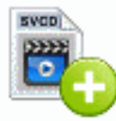
File SVCD Add