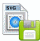
File SVG Save