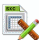
File SXC Tools