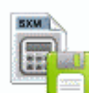
File SXM Save