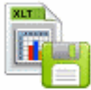
File XLT Save