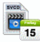
File SVCD Calendar