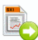
File SXI Next