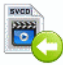
File SVCD Back