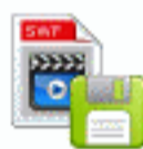
File SWF Save