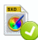
File SXD Ok