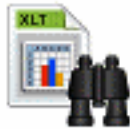
File XLT Search