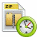
File ZIP Clock