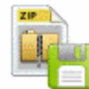
File ZIP Save