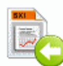
File SXI Back