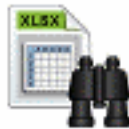
File XLSX Search