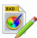
File SXD Write