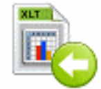
File XLT Back