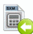
File SXM Back