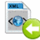
File XML Back