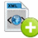
File XML Add