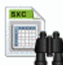
File SXC Search