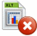
File XLT Cancel