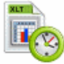
File XLT Clock