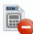
File SXM Remove