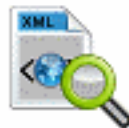
File XML Zoom