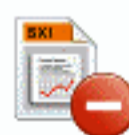
File SXI Remove