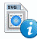
File SVG Info