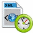
File XML Clock