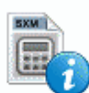
File SXM Info