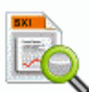
File SXI Zoom